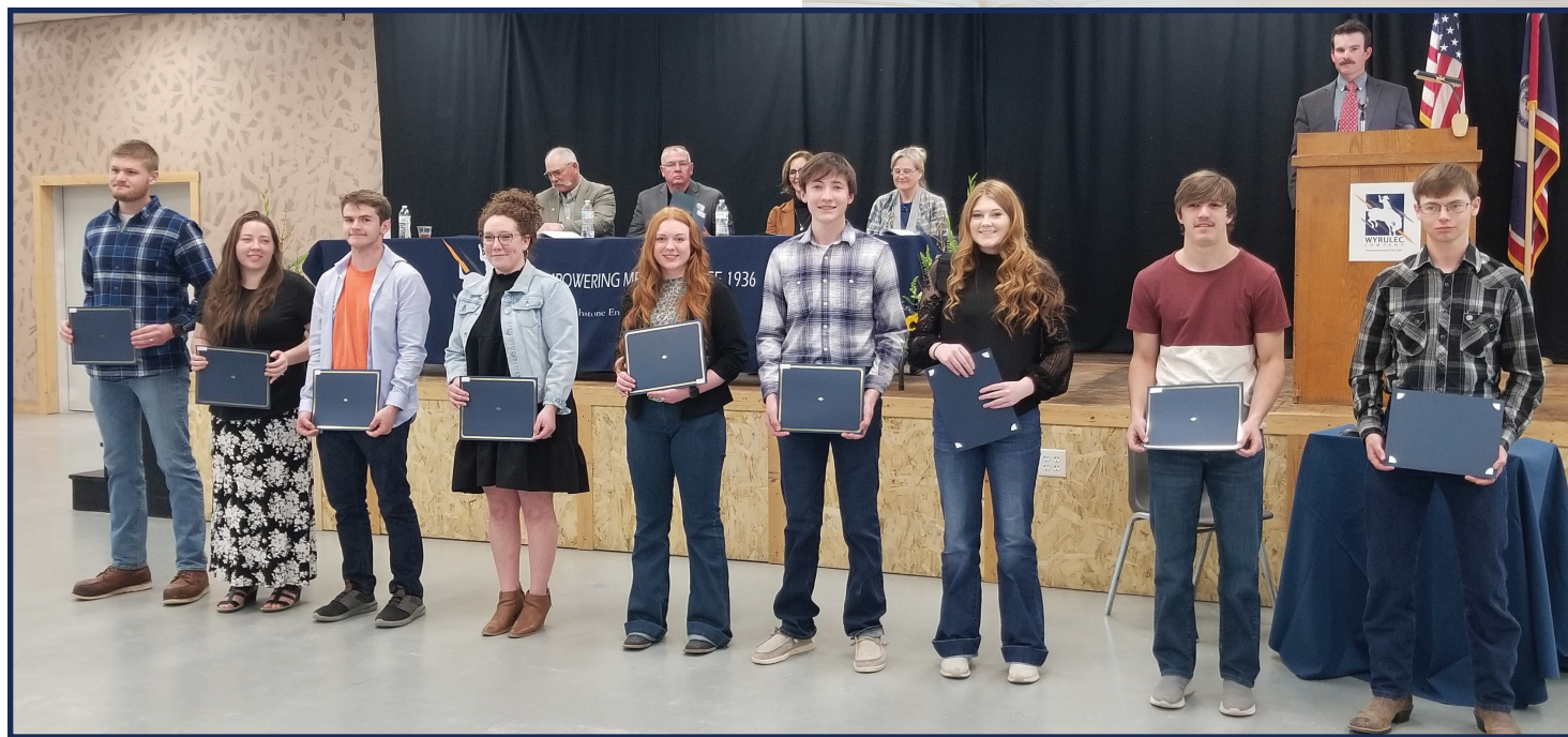
2022 Scholarship Recipients

The following names have been drawn for a $25 bill credit. Contact Wyrulec Company at 877-WYRULEC to claim your credit!