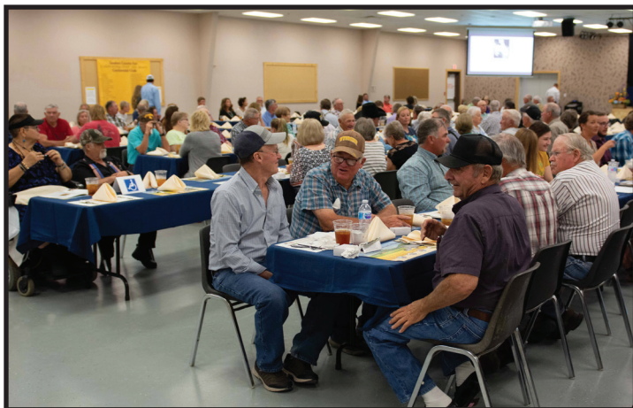
Wyrulec Members enjoying dinner

Although Wyrulec provides convenient electronic options for bill-paying and communication, there are times when there is no substitute for in-person engagement. When members of our community come together for a common purpose, we improve the quality of life for all in our corner of the world.