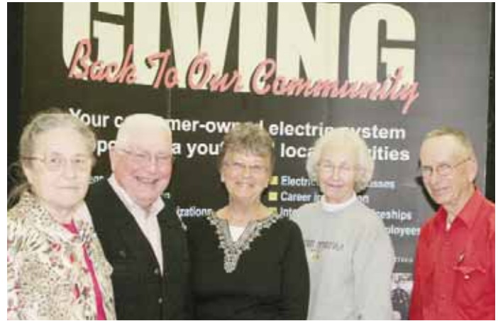
Not so long ago, these friends were at the same school