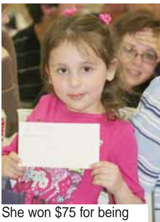
She won $75 for being the youngest electricity consumer in the crowd.