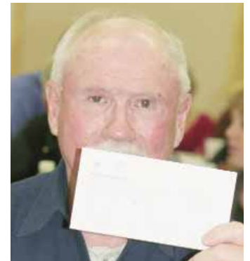
He won $75 for having the birthday closest to the co-op's founding date of Oct. 9